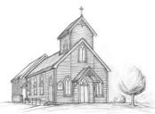
ST JOHN THE BAPTIST